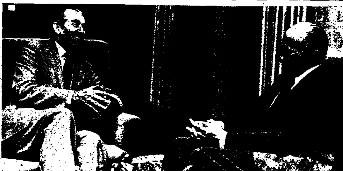
President Chaim Herzog confers on Friday with Prime Minister Menachem Begin at Beit Hamas. The two met privately without aides present. The prime minister's visit to the U.S. later this month was among topics discussed.